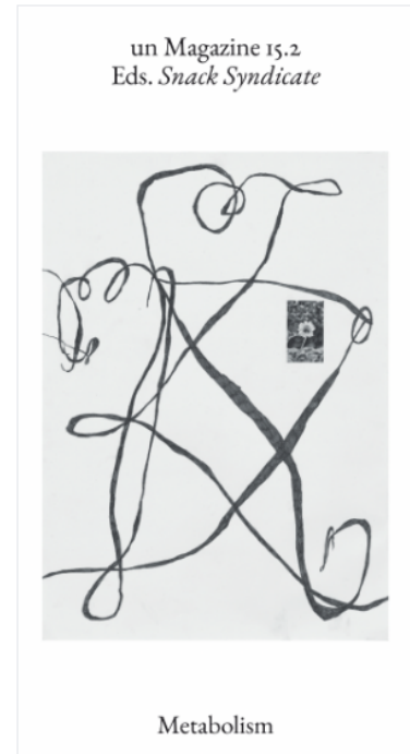
un 15.2 November 2021