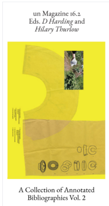
un 16.2 November 2022